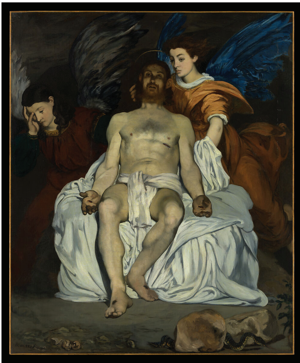
The Dead Christ with Angels, Edouard Manet, 1864, Oil on canvas

FRIDAY, MARCH 29, 2024 GOOD FRIDAY 6:00 P.M.